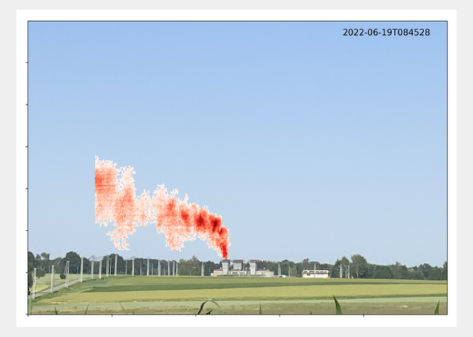
The image shows a coal mine ventilation shaft which emits methane. Methane is invisible to the human eye, yet the HySpex camera reveals the plume emanating from the left shaft. Darker colours correspond to a higher atmospheric methane content.

To better understand and monitor methane emissions in line with the goals of the Paris climate accord and its monitoring, verification reporting, and requirements, scientists have turned to spectroscopic remote sensing. This method allows the observation and tracking of the release of methane into the atmosphere. Among the various sectors contributing to methane emissions, the fossil fuel industry stands out, accounting for over 30% of global anthropogenic CH4 emissions